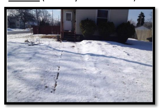
AFTER (walkway-secured door)